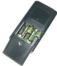
12-Lead Blue-tooth Transmitter: Front & Back