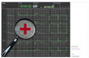
ECG Sampling Screen